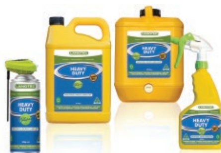
HEAVY DUTY An Industrial lubricant and corrosion inhibitor.