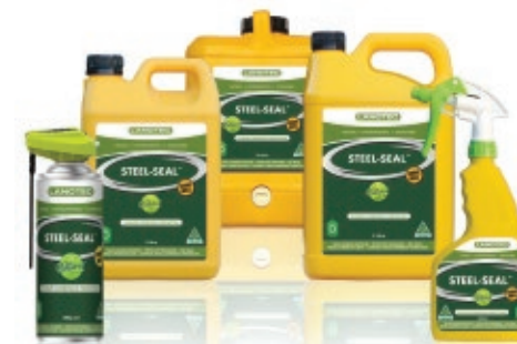
STEEL-SEAL™ A high-performance corrosion inhibitor.