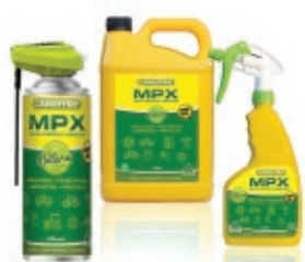
MPX A multi-purpose lubricant and penetrant.