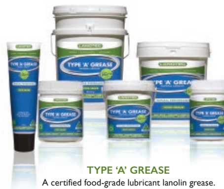
TYPE 'A' GREASE A certified food-grade lubricant lanolin grease.