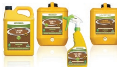
TIMBER SEAL & TIMBER SEAL PLUS Timber protectors and moisture repellent.