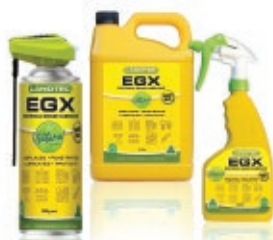
EGX An electrical lubricant and penetrant.