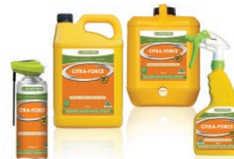
CITRA-FORCE An industrial-strength cleaner and natural degreaser.