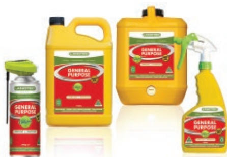
GENERAL PURPOSE A lubricant and corrosion inhibitor.