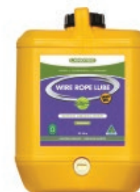
WIRE ROPE LUBE An industrial cable lubricant.