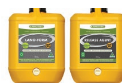
RELEASE AGENT Ready-to-use and concentrate.