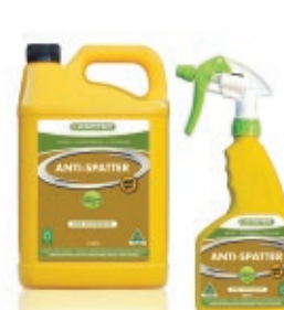
ANTI-SPATTER A welding protector and lubricant.