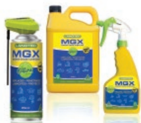
MGX A marine lubricant and penetrant.